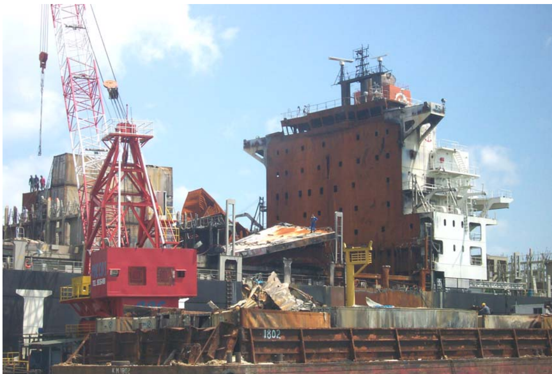
Photo 11. The M/V HANJIN PENNSYLVANIA (port) in Singapore during salvage and recovery operations. Note the twisted and upraised deck hatch now resting in the port side forward rack above hold six. The deck hatches from the port side and center racks in the aft rack of hold six are missing.