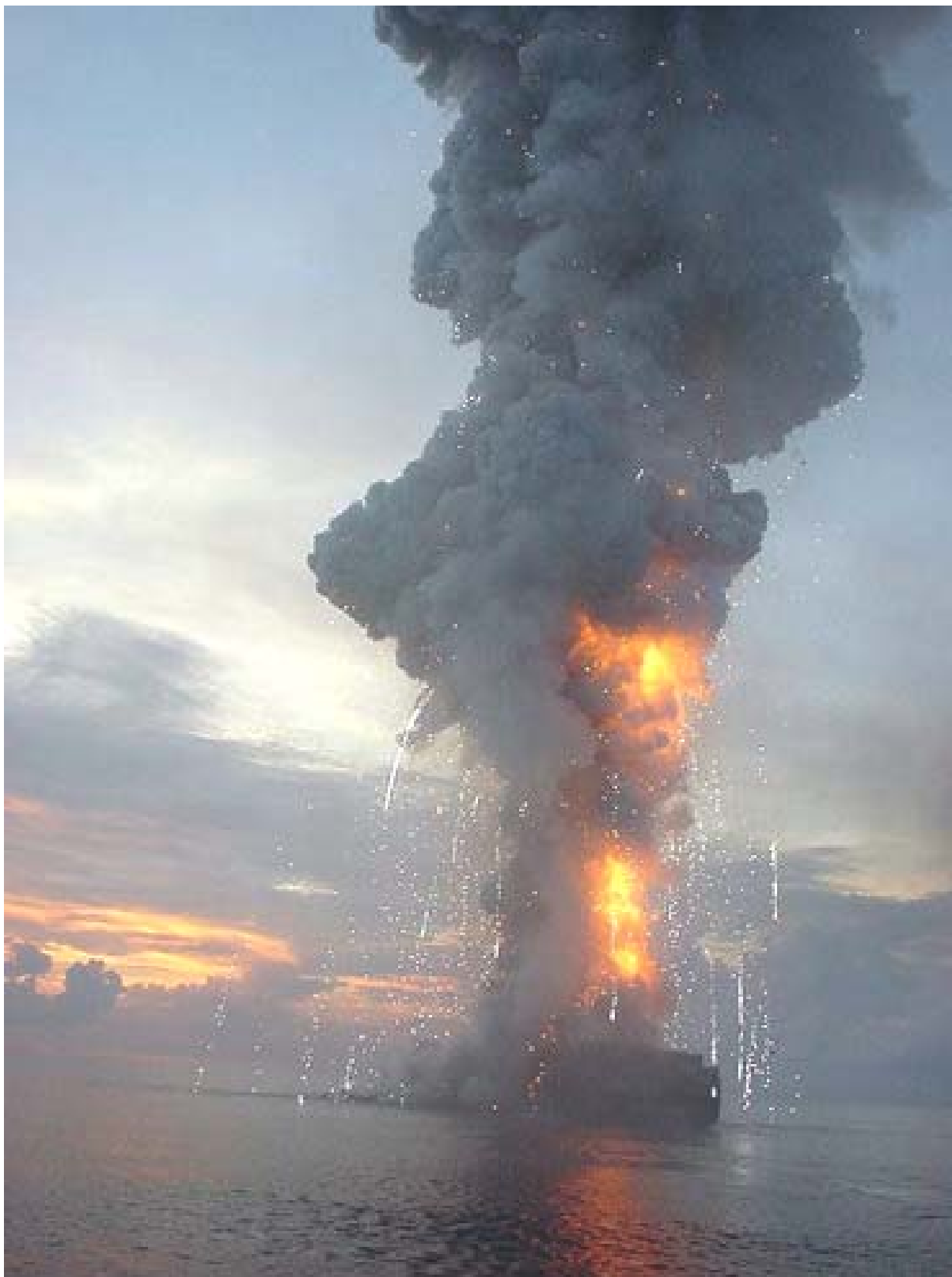
Photo 5. November 15 th . The massive explosion in hold six aboard the M/V HANJIN PENNSYLVANIA. Note the large, rising orange fireball the tremendous plume of gray-black smoke and silver effects rising with the plume and then falling back to the sea.