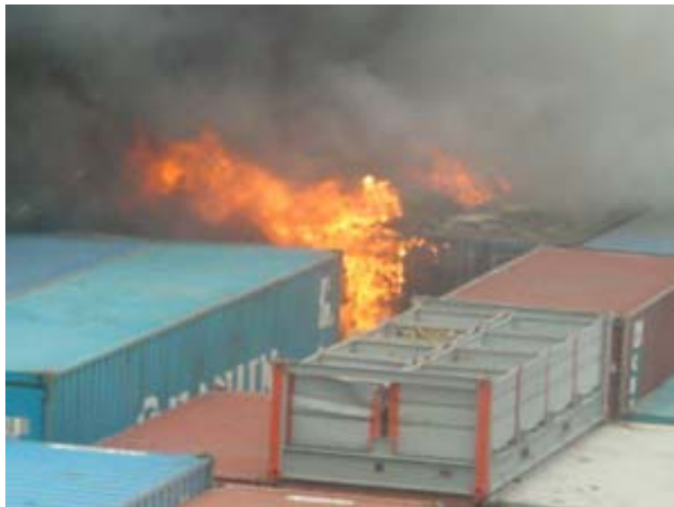
Photo 2. November 11 th . Fires in containers above hold four on the port side.