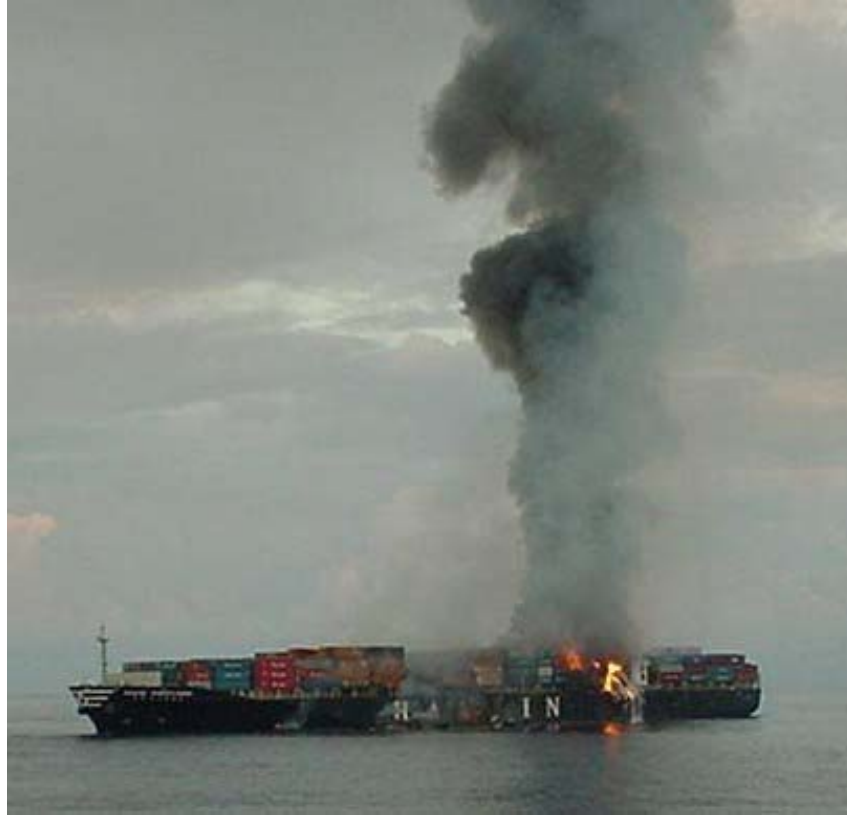
Photo 6. The M/V HANJIN PENNSYLVANIA (port) after the explosion of Nov 15 th in hold six. Fires continue to burn above hold six and smolder above hold four. Note the missing containers above hold four and the plume of gray-black smoke from hold six.