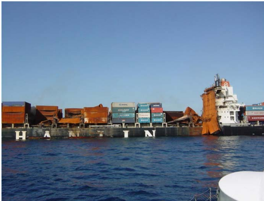
Photo 7. The M/V HANJIN PENNSYLVANIA (port) riding very low in the water as a result of fire fighting efforts. Note the burned containers above hold three and the missing and burned containers above hold four. Also note the raised and twisted deck hatch, the missing containers and heavy damage to the containers above hold six forward of the accommodation. Damaged containers above hold six are hanging over the port side