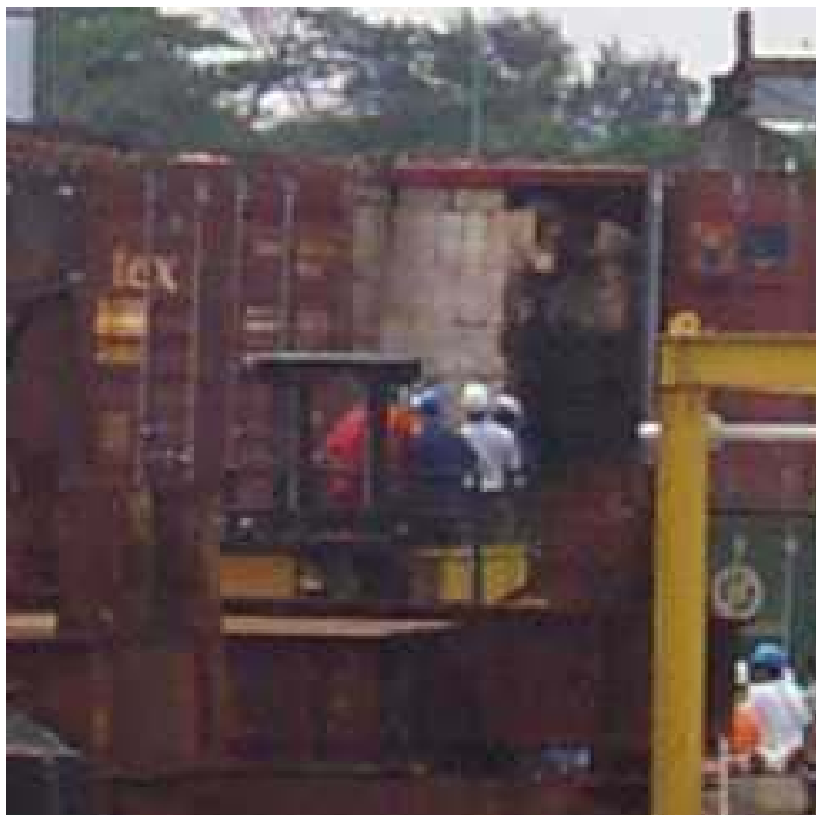
Photo 13. A container with fireworks from the M/V HANJIN PENNSYLVANIA is surveyed in Singapore. Note the cartons to the right and nearest to the door have heavy fire damage but the cartons to the left do not. A motorized forklift is being used to lift the General Average and some surveyors to view the top tier of over 50 containers of fireworks. About 20 other people viewed this from the ground. Cutting and grinding as well as other metal salvage operations continued in the vicinity of this busy salvage yard. These containers were handled from the ship to the salvage yard despite the fact many of these containers were water logged from the fire fighting efforts and had been exposed in the equatorial sun for over a month.