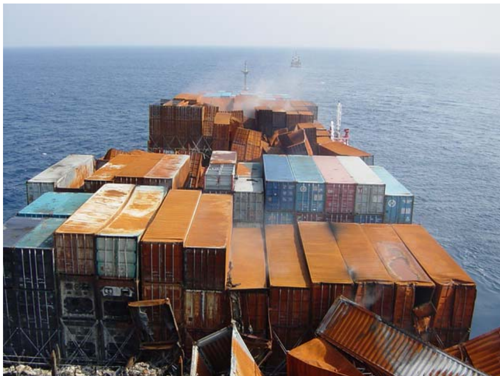
Photo 8. The view after Nov 15 th from the accommodation of M/V HANJIN PENNSYLVANIA. Note the missing containers on the port side of hold 4 where the initial explosion occurred on Nov 11 th .