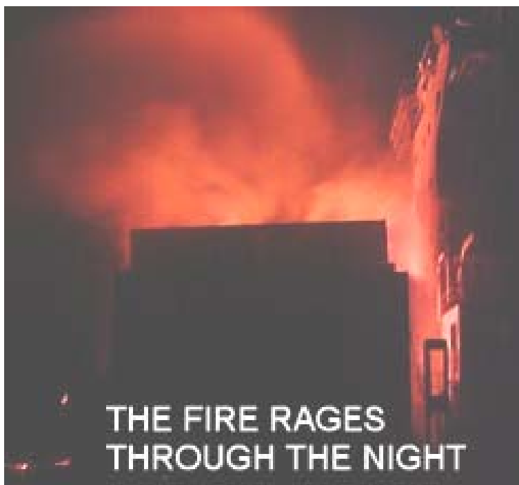
Photo 4. Containers above hold six and forward of the accommodation burning. Note the intensity of the fire and the location of the accommodation to the right.