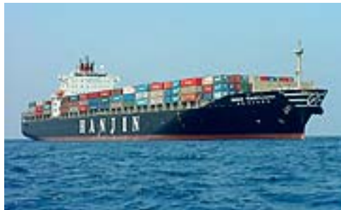
Photo 1. The newly built M/V HANJIN PENNSYLVANIA (starboard) fully loaded with containers. Holds one-six are from the bow to the accommodation, holds seven and eight are from the accommodation to the stern. Note how high in the water the ship is in this picture.