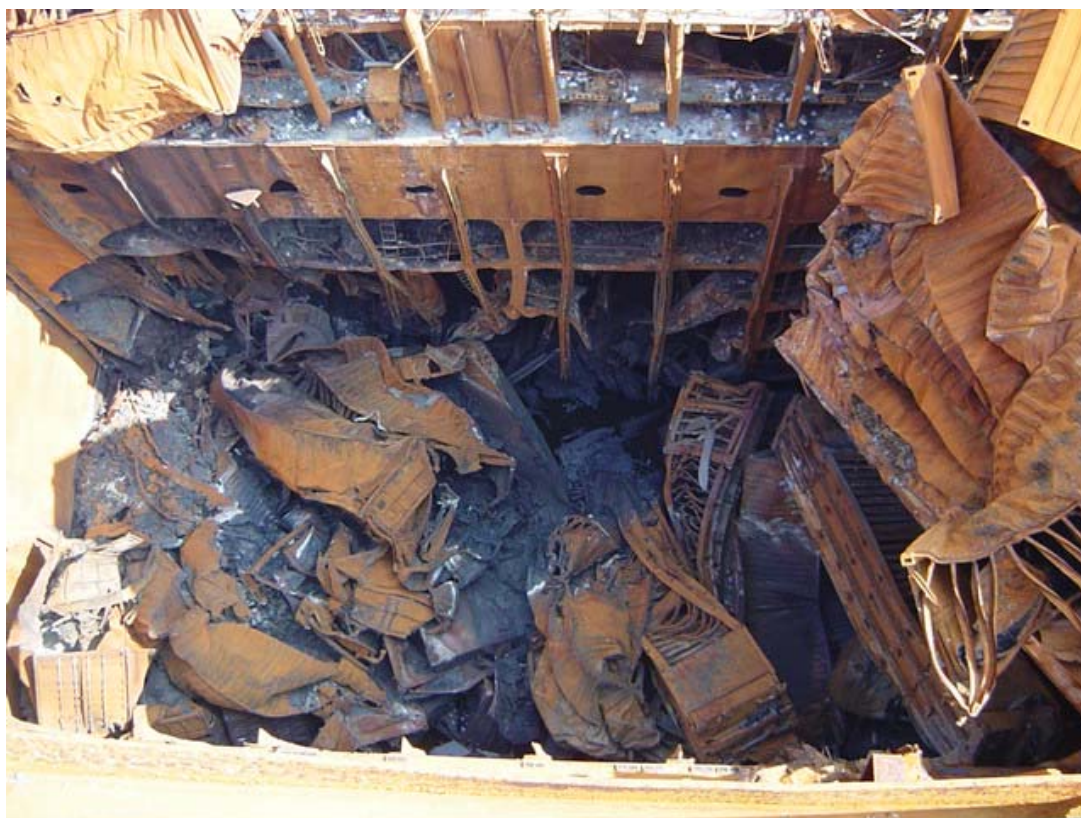
Photo 9. The aftermath of the Nov 15 th explosion in hold six. Note the twisted wreckage here and compare to the containers above holds three, four and five.