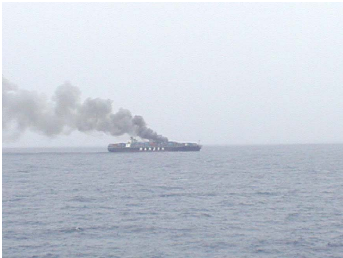
Photo 3. November 11 th . M/V HANJIN PENNSYLVANIA (starboard) the morning of the first explosion above hold four. Fires continued to burn for 4-days and spread to containers above hold six forward of the accommodation.