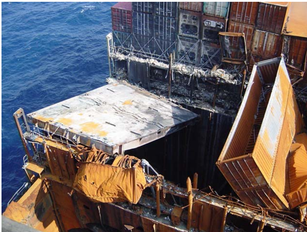
Photo 10. The aftermath of the Nov 15 th explosion above hold six. Note the deck hatch (weight approximately 30 tons) that is normally held in place by a series of heavy pins.