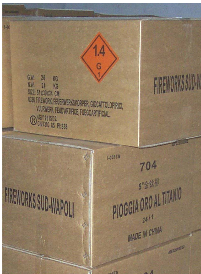
Photo 14. A warehouse full of 5” and 6” aerial fireworks shells in a Chinese warehouse await shipment to a European customer. Note the 1.4G classification and the various European language descriptions on the top carton of 5” aerial shells. These same aerial fireworks would be classified as 1.3G if shipped to the United States and other markets.