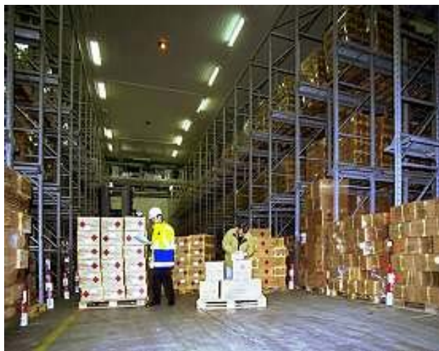
Photo 15. A distribution warehouse utilizing rack storage for imported 1.4G fireworks in Hamburg, Germany. No sprinkler system is apparent and the stacks of cartons on these pallets are not stabilized. Electrical systems do not appear to be explosion proof and motorized equipment is clearly used to move the pallets of fireworks. Distances from this building to other buildings and public areas is not known.