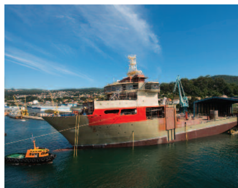
Deep Orient launch, August 2012

In February 2011, Technip announced it is investing in a newbuild DP2 flexlay construction vessel, which will be dedicated to the Asia-Pacific market. The vessel will be known as "Deep Orient" and will join the Technip fleet in 2013. This initiative demonstrates Technip's commitment to the Asia-Pacific region and represents a key element of the Group's long-term growth strategy.