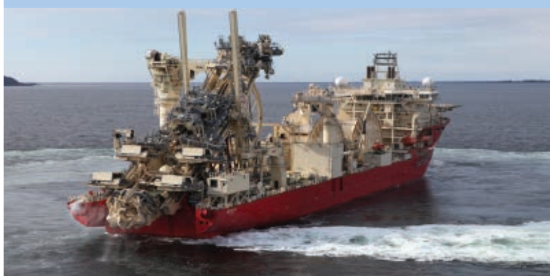
View of working deck