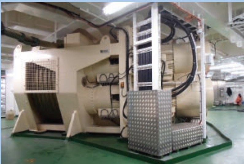
500 Te traction winch