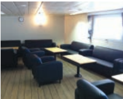
Day room 2

Deep Energy achieved a trial speed of 20 knots and has a maximum service speed of 19.5 knots to enable fast transit times between spoolbase and field locations and to shorten international transits between projects.