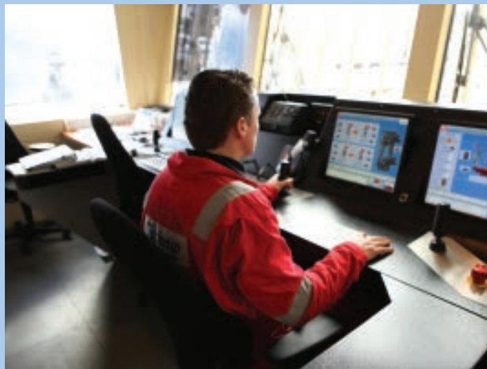
Aft pipelay control room