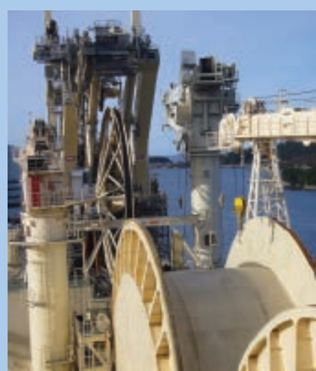
Pipelay reels and cranes