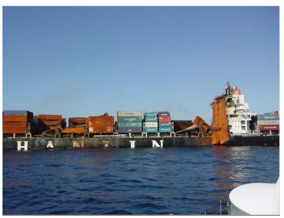
Photo 7. The M/V HANJIN PENNSYLVANIA (port) riding very low in the water as a result of fire fighting efforts. Note the burned containers above hold three and the missing and burned containers above hold four. Also note the raised and twisted deck hatch, the missing containers and heavy damage to the containers above hold six forward of the accommodation. Damaged containers above hold six are hanging over the port side

Photo 6. The M/V HANJIN PENNSYLVANIA (port) after the explosion of Nov 15<sup>th</sup> in hold six. Fires continue to burn above hold six and smolder above hold four. Note the missing containers above hold four and the plume of gray-black smoke from hold six.