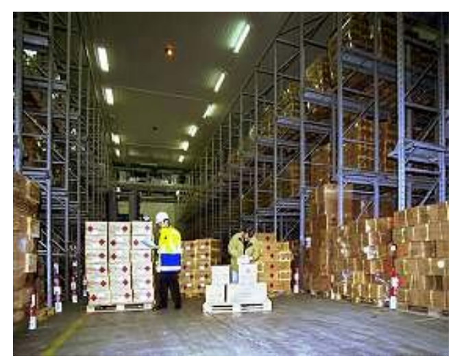
Photo 15. A distribution warehouse utilizing rack storage for imported 1.4G fireworks in Hamburg, Germany. No sprinkler system is apparent and the stacks of cartons on these pallets are not stabilized. Electrical systems do not appear to be explosion proof and motorized equipment is clearly used to move the pallets of fireworks. Distances from this building to other buildings and public areas is not known.

Photo 14. A warehouse full of 5" and 6" aerial fireworks shells in a Chinese warehouse await shipment to a European customer. Note the 1.4G classification and the various European language descriptions on the top carton of 5" aerial shells. These same aerial fireworks would be classified as 1.3G if shipped to the United States and other markets.