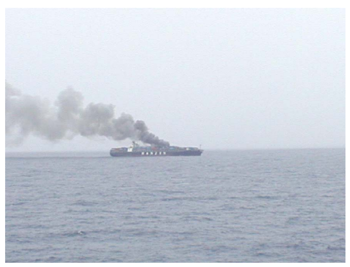
Photo 3. November 11<sup>th</sup>. M/V HANJIN PENNSYLVANIA (starboard)the morning of the first explosion above hold four. Fires continued to burn for 4-days and spread to containers above hold six forward of the accommodation.