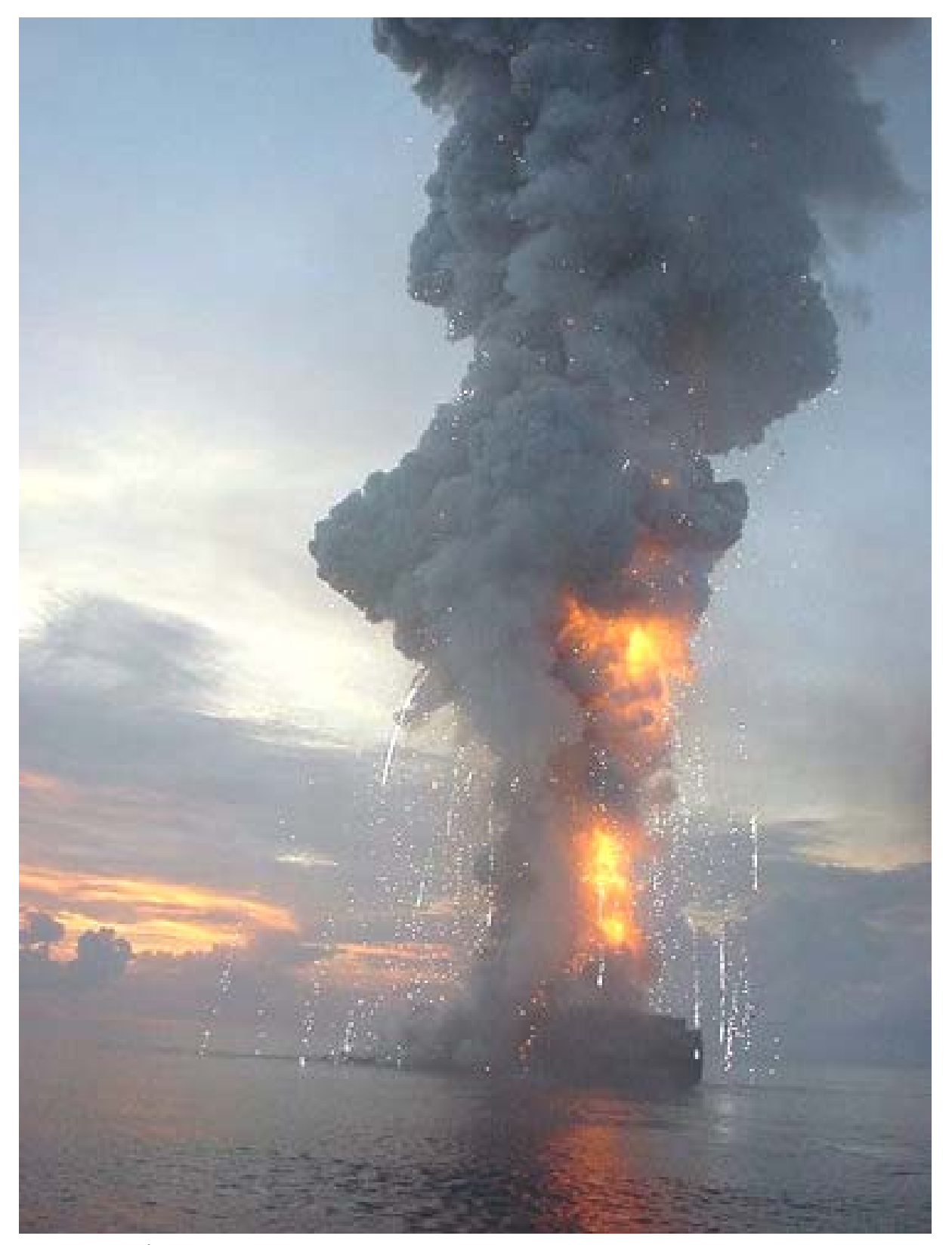
Photo 5. November 15<sup>th</sup>. The massive explosion in hold six aboard the M/V HANJIN PENNSYLVANIA. Note the large, rising orange fireball the tremendous plume of gray-black smoke and silver effects rising with the plume and then falling back to the sea.