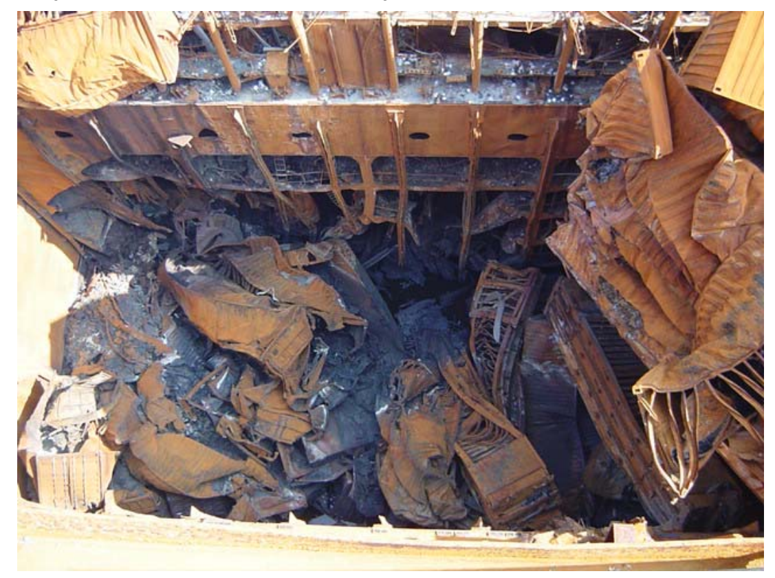
Photo 9. The aftermath of the Nov 15<sup>th</sup> explosion in hold six. Note the twisted wreckage here and compare to the containers above holds three, four and five.

Photo 8. The view after Nov 15<sup>th</sup> from the accommodation of M/V HANJIN PENNSYLVANIA. Note the missing containers on the port side of hold 4 where the initial explosion occurred on Nov 11<sup>th</sup>.