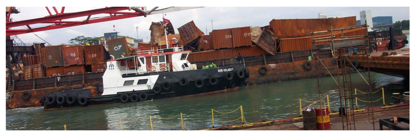
Photo 12. A barge in a Singapore salvage yard with burned out containers from M/V HANJIN PENNSYLVANIA. Note the orange 1.4G placards on the containers to the left (0#, 06 and 07) that curiously survived in spite of the fact the paint did not.