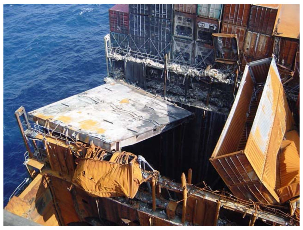
Photo 10. The aftermath of the Nov 15<sup>th</sup> explosion above hold six. Note the deck hatch (weight approximately 30 tons) that is normally held in place by a series of heavy pins.