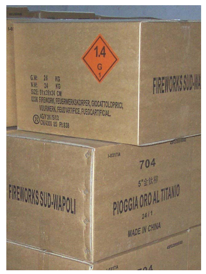
Photo 14. A warehouse full of 5" and 6" aerial fireworks shells in a Chinese warehouse await shipment to a European customer. Note the 1.4G classification and the various European language descriptions on the top carton of 5" aerial shells. These same aerial fireworks would be classified as 1.3G if shipped to the United States and other markets.