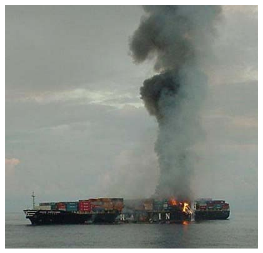
Photo 6. The M/V HANJIN PENNSYLVANIA (port) after the explosion of Nov 15<sup>th</sup> in hold six. Fires continue to burn above hold six and smolder above hold four. Note the missing containers above hold four and the plume of gray-black smoke from hold six.