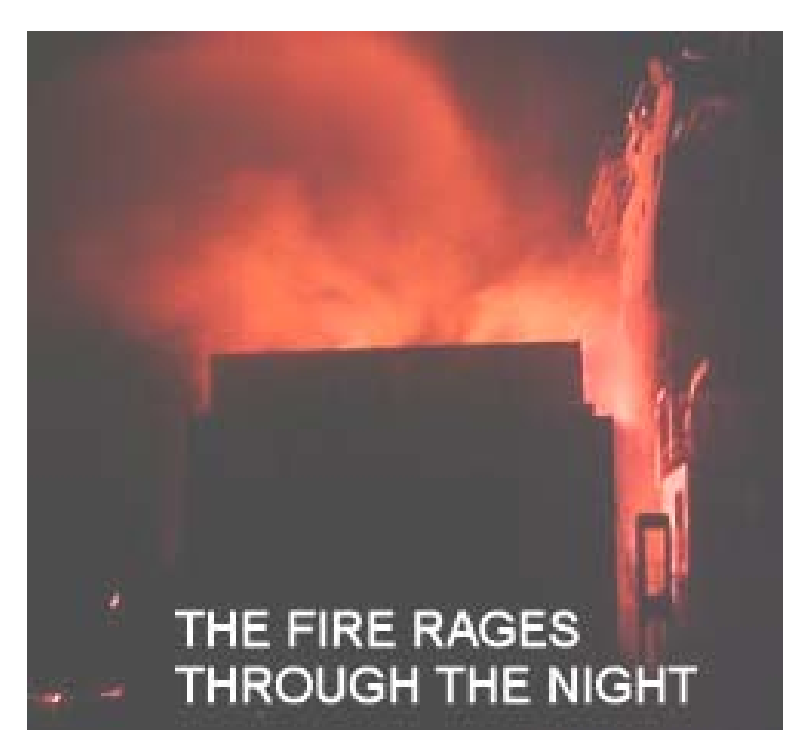
Photo 4. Containers above hold six and forward of the accommodation burning. Note the intensity of the fire and the location of the accommodation to the right.

Photo 3. November 11<sup>th</sup>. M/V HANJIN PENNSYLVANIA (starboard)the morning of the first explosion above hold four. Fires continued to burn for 4-days and spread to containers above hold six forward of the accommodation.