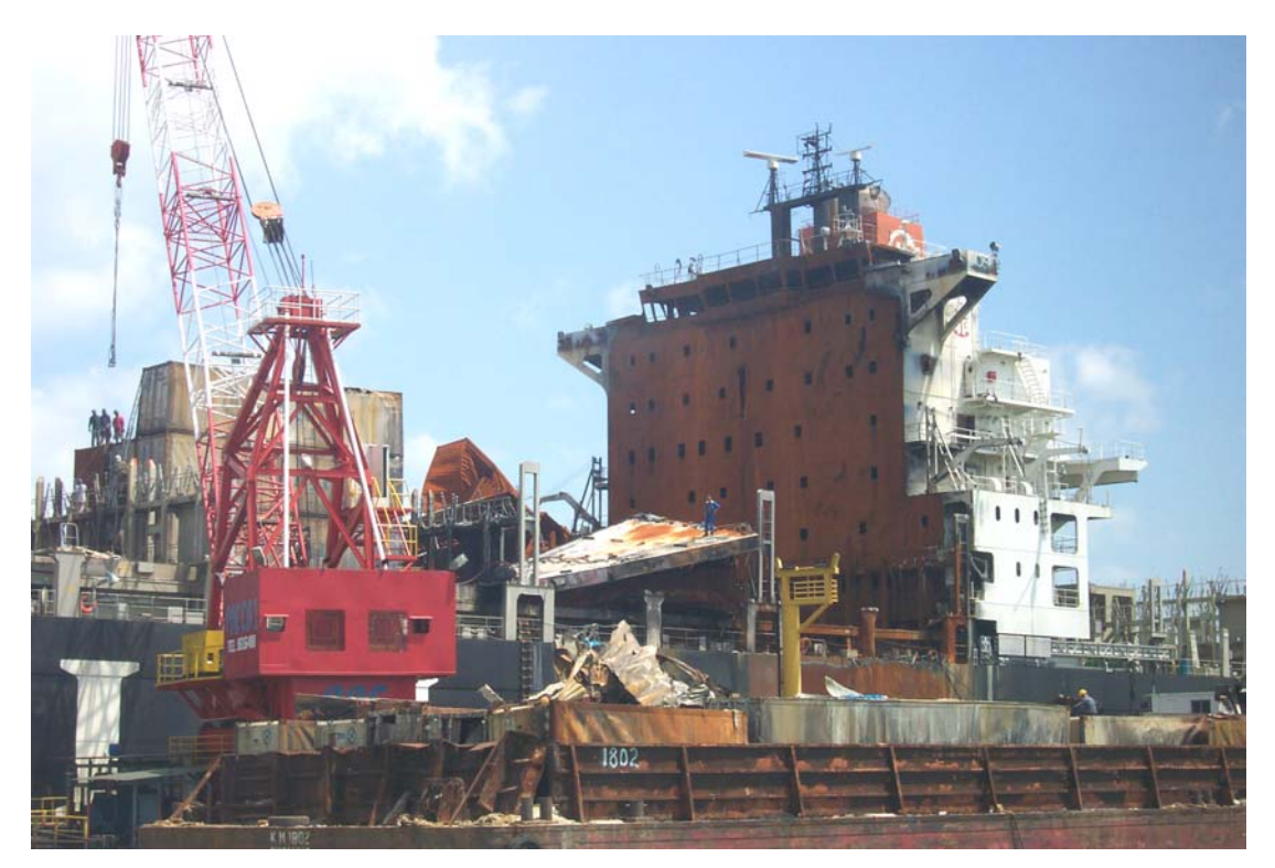
Photo 11. The M/V HANJIN PENNSYLVANIA (port) in Singapore during salvage and recovery operations. Note the twisted and upraised deck hatch now resting in the port side forward rack above hold six. The deck hatches from the port side and center racks in the aft rack of hold six are missing.

Photo 10. The aftermath of the Nov 15<sup>th</sup> explosion above hold six. Note the deck hatch (weight approximately 30 tons) that is normally held in place by a series of heavy pins.