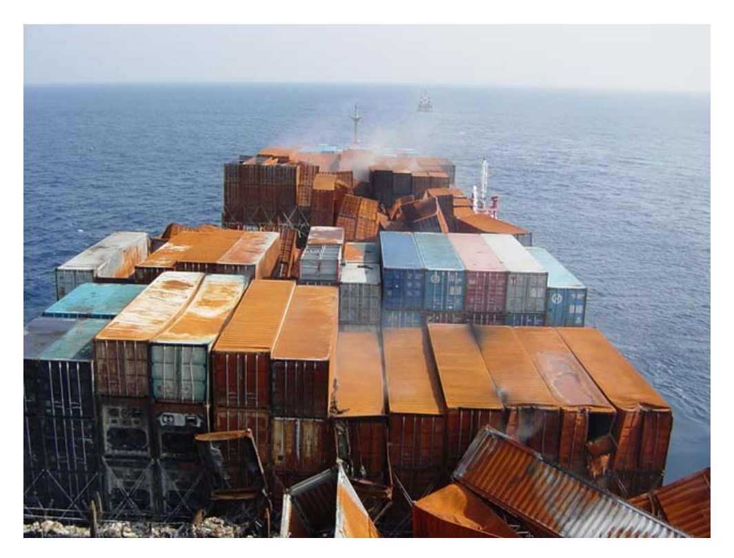
Photo 8. The view after Nov 15<sup>th</sup> from the accommodation of M/V HANJIN PENNSYLVANIA. Note the missing containers on the port side of hold 4 where the initial explosion occurred on Nov 11<sup>th</sup>.